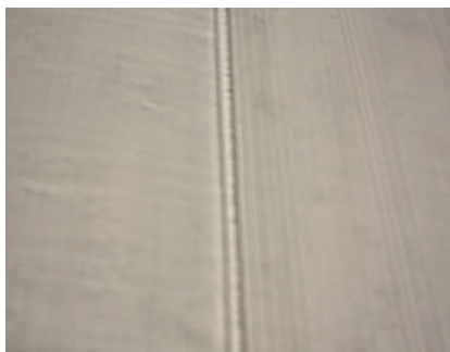
Fig. 2. Comparison of the silhouette of the test films produced in the Chill-Roll process (right half with die lines running in the direction of extrusion) and those with a closed polishing gap (left half without die lines)

Extremely thin films in optical quality could be produced immediately using the thus modified pilot polishing roll stack ( Fig. 2 ). The films were equal in quality to those produced on a larger production line for greater thicknesses and with years of experience in terms of the processing parameters to be set. Using the modified roll stack and the flexible jacket roll mounted in it, a 35 % reduction in thickness could be achieved immediately compared with the smallest thickness previously achieved on the pilot polishing roll stack in various test runs using conventional rolls. This was achieved without the problems of extreme variations in gap parameters that come from using massive rolls and rigid roll clamps. One reason for this was the fact that ultimately the films could be produced at a specific line load of only 60 N/cm. At such low clamping