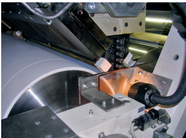
Fig. 1. Film polishing roll stack with integrated rubber covered polishing roll

metal rollers would appear quite realistic. Consequently, the old strategy that combined minimal clamping forces with small-diameter polishing rolls [4] was dusted off and a polishing roll stack correspondingly modified. In addition, an entirely new all-metal roll with a relatively small diameter of only 180 mm was designed and constructed in close cooperation with van Baal GmbH of Krefeld, Germany. This roll was also modified insofar as it has a very thin outer jacket. The resulting reduction in stiffness enables it to adapt to thickness differences in the entering melt curtain.